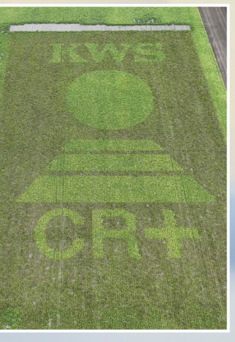
The CR+<sup>®</sup> trait from KWS delivers Cercospora protection

Put the power of to work in your fields.