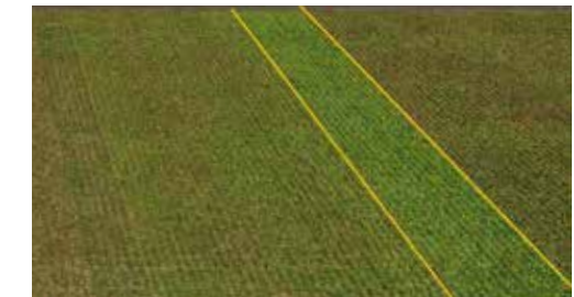
Glyndon, MN Strip Trial. CR+® Tolerant Varieties inside the yellow lines.